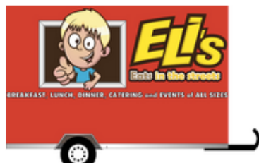
Eli's Eats in the Streets General Member