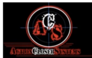
Action Closer General Member