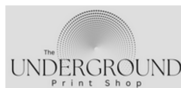
Underground Print Shop General Member