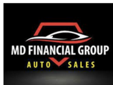
MD Financial Group General Member